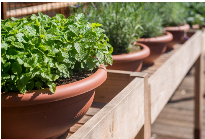
Figure 3. Ramps and hanging garden of aromatic herbs.