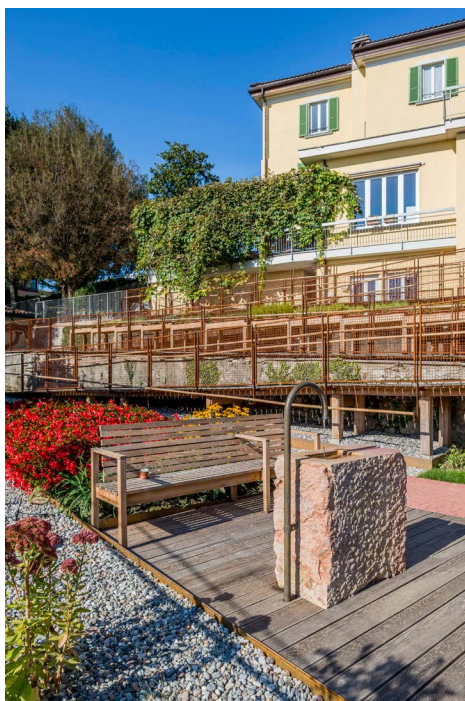
Figure 4. Marble fountain.

enrolled in this program must also be able to take all medications prior to attending the daycare program or after. Patients that were not enrolled in the day care program were excluded from this study.